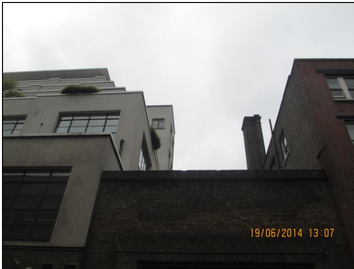
Image 4: Relationship between neighbouring building York Central and application site